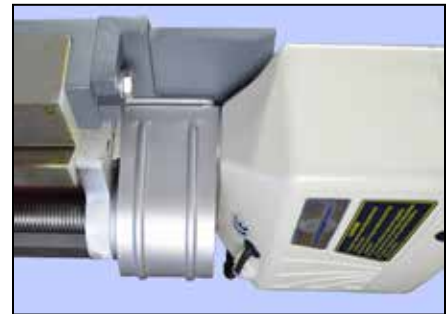
Figure 4 Install the gear cover

Connect 110Vac power. Run the power feed unit slowly in both directions. If gear noise is an issue, try raising or lowering the power feed unit — but don't expect a totally silent drive (these are straight-cut gears). Tighten the hex head screws, Figure 2.