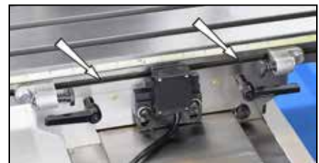
Figure 5 Install the limit switch components To install the travel stop bumpers, left and right, it may be necessary to grind the T-nuts so they fit in the dovetail slot (arrowed) on the facing surface of the table. Install the limit switch in place of the table position marker post. Set the limit switch to align with the travel stop bumpers.