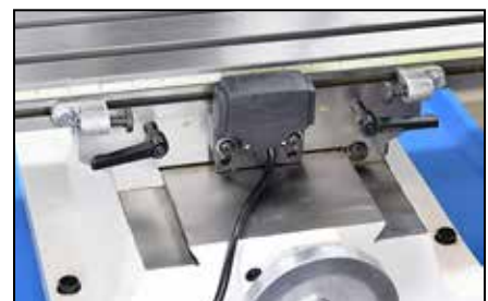
Figure 6 Install the limit switch cover The cover has internal springs. Be sure they are in line with the limit switch plungers. When properly installed the cover should be freely movable from side to side with a small amount of spring resistance.