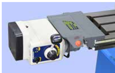
Figure 3 Install the power feed unit Slide the unit down to engage the two pinions. Snug the hex head screws, but don't fully tighten.