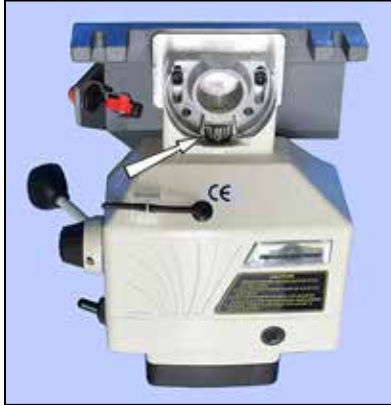
Figure 1 Power feed unit as shipped This is the underside of the unit. The pre-installed gray casting at top is referred to in the power unit manual as the "Big Adapter". The drive gear is arrowed.

The power feed available from Precision Matthews is powered by the standard 110Vac 60 Hz supply. It comes with a complete manual and all mounting hardware. The outline description and photos on this page show the power feed unit installed on the PM-30MV.